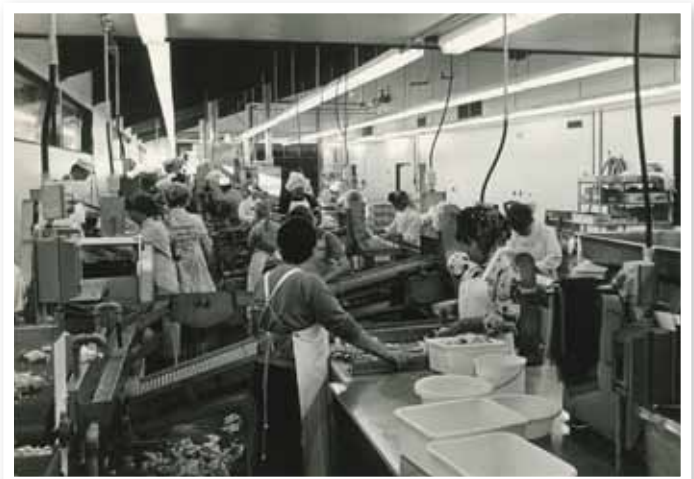
Female workers process king crab at Port Wakefield Cannery, c. 1960s.

Kodiak Historical Society, Kodiak Daily Mirror collection, P837-5-10