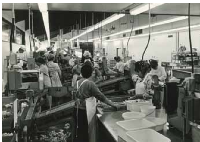
Female workers process king crab at Port Wakefield Cannery, c. 1960s.

Kodiak Historical Society, Kodiak Daily Mirror collection, P837-5-10