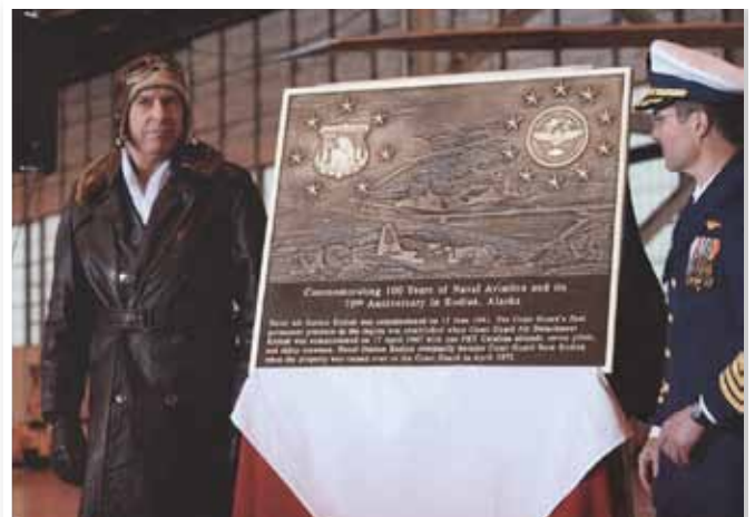
Commemorating 100 years of Naval Aviation and its 70th anniversary in Kodiak, Alaska.