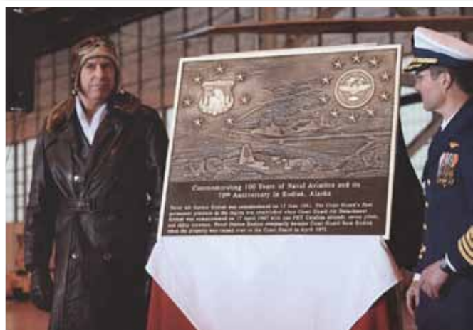
Commemorating 100 years of Naval Aviation and its 70th anniversary in Kodiak, Alaska.