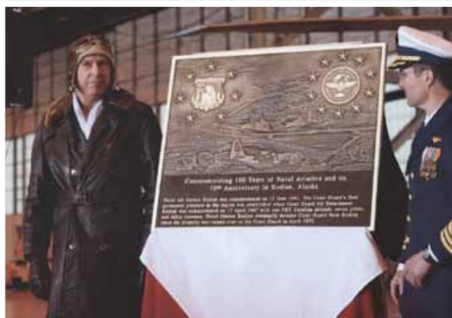
Commemorating 100 years of Naval Aviation and its 70th anniversary in Kodiak, Alaska.

Kodiak Historical Society, Wingfeld collection, P-885-5