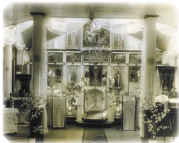
Interior of Holy Resurrection Russian Orthodox Church in Kodiak, 1943.