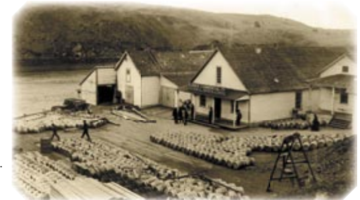
Right: Barrels of salted fish line the AK Commercial Company dock at Kodiak, early 1900's.